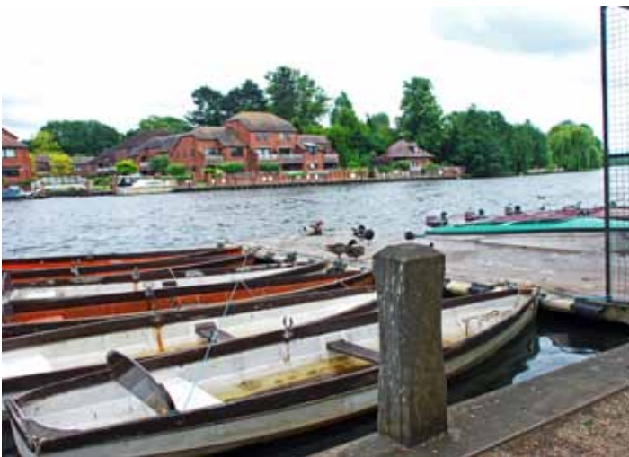
Rowing boats for hire at Marlow