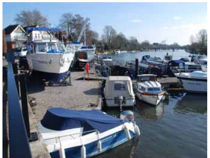
Bourne End Marina