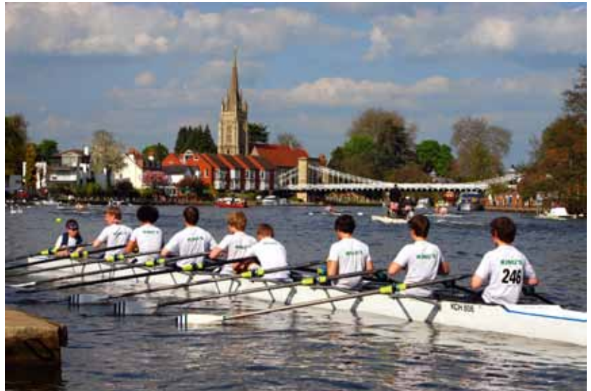
Rowers in Marlow's Spring Regatta

Along the way you will see the physical characteristics of the Middle Thames – its width and its bends, its floodplains and its sediments, its fish and wildfowl.