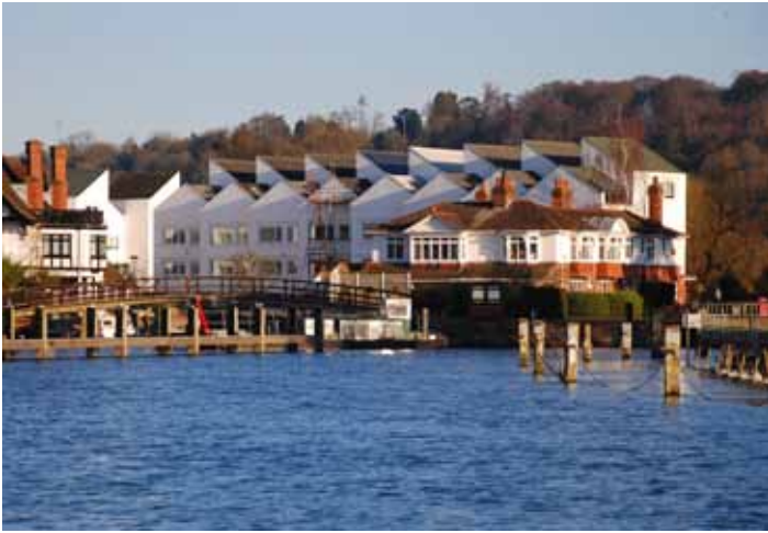
Modern housing development on the site of Marlow Mills