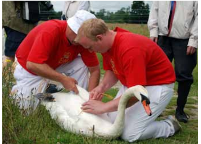
Swan Uppers with a mute swan