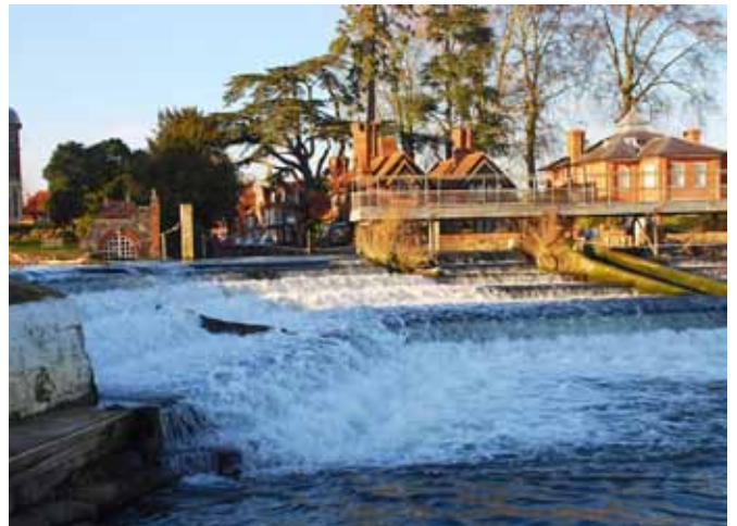
View across the weir to the end of St Peter Street