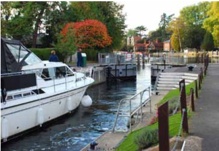
Marlow Lock